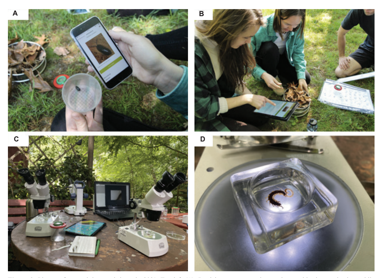
Figure 2. Pictures from training workshops in 2021. Top left (A): Participant compares its specimen with pictures in the mobile application. Top right (B): Participants are training the identification of soil animals in the field. Bottom left (C): Soil animal identification workshop with stereo microscopes. Bottom right (D): In ethanol preserved specimens of Chilopoda and Diplopoda.

types, biology and identification of soil animals. Thereby, we aimed to improve data quality by counteracting recording of falsely identified species (despite of expert validation) and to engage participants in the project. The program consisted of a general introduction which was followed by a collective exploration of the main functions of BODENTIERhoch4 (all participants were asked to download the application to their mobile phones or tablets in advance). Thereupon, the participants were equipped with a stereo microscope (10-40x), basic dissection tools and a set of specimens of Chilopoda and Diplopoda (identified at species-level and preserved in ethanol). During the identification process, participants could familiarize with the use of the identification keys and train their taxonomic skills. Subsequently the participants collected living soil animals and practised their skills with the mobile application. Whenever, during an excursion, specimen have been identified correctly, participants were encouraged to report their results via the recording functions of the application. All steps of animal identification were accompanied by an expert supervisor.