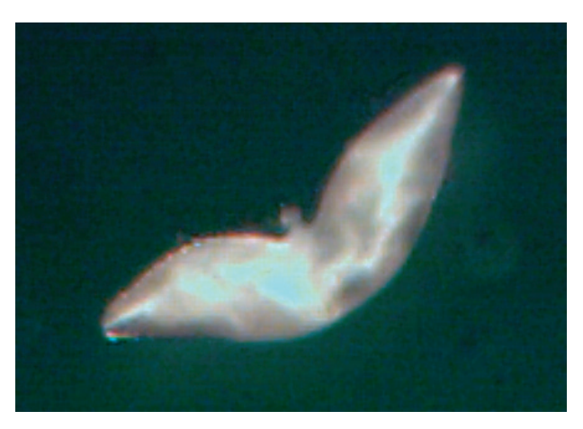
Figure 10. Microscopic view on the spermatheca of Polyrhachis dives (Smith, 1857).