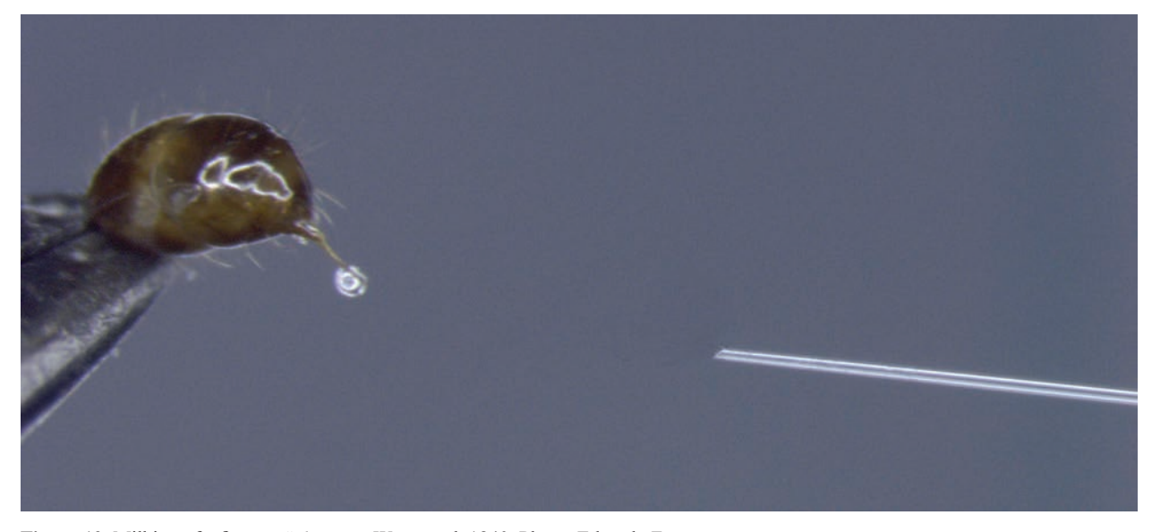
Figure 12. Milking of a fire ant Solenopsis Westwood, 1840.