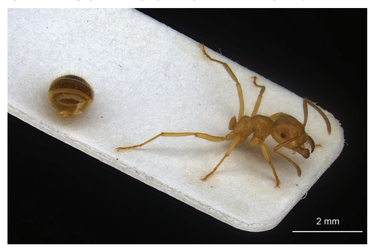
Figure 6. Special preparation of Lasius nitidigaster Seifert, 1996.

microscopy (Forbes & Do-Van-Quy 1965, Gotwald & complex, Wagner et al. 2017, Schlick-Steiner et al. 2006). Burdette 1981). The value of male genitalia for species In several genera such as Myrmica, Lasius or Formica, separation is, according to present knowledge, significant species are much better separable by somatic characters