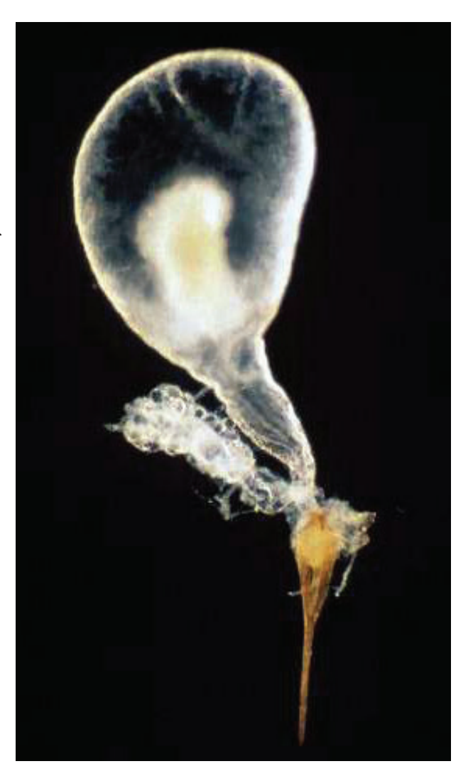
Figure 11. Poison/Dufour gland of Solenopsis Westwood, 1840.

It is of high scientific value to understand the communication of the eusocial insects, for example in the two very important taxa ants and bees (Hölldobler & Wilson 1990). Thus, the compounds which are produced in the numerous glands (Fig. 11) have to be characterized and studied (Hölldobler & Engel 1978, Hölldobler & Engel-