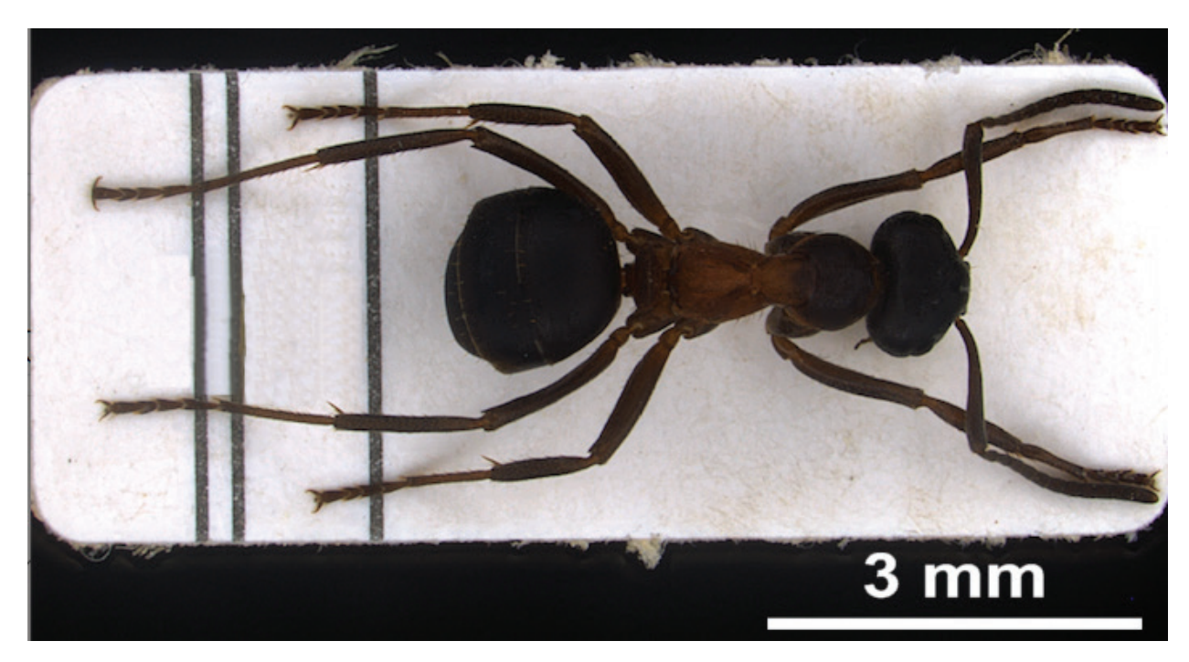
Figure 3. Top view on Formica uralensis Ruzsky, 1895 in standing position.