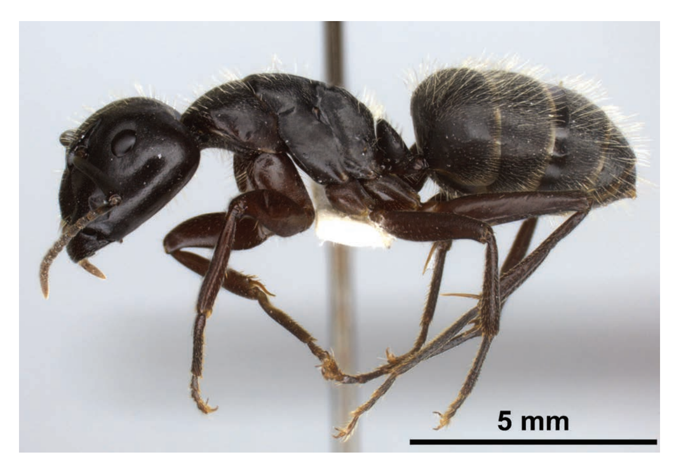
Figure 4. Mounted specimen of Camponotus vagus (Scopoli, 1763) in a preparation recommended by Wilson.