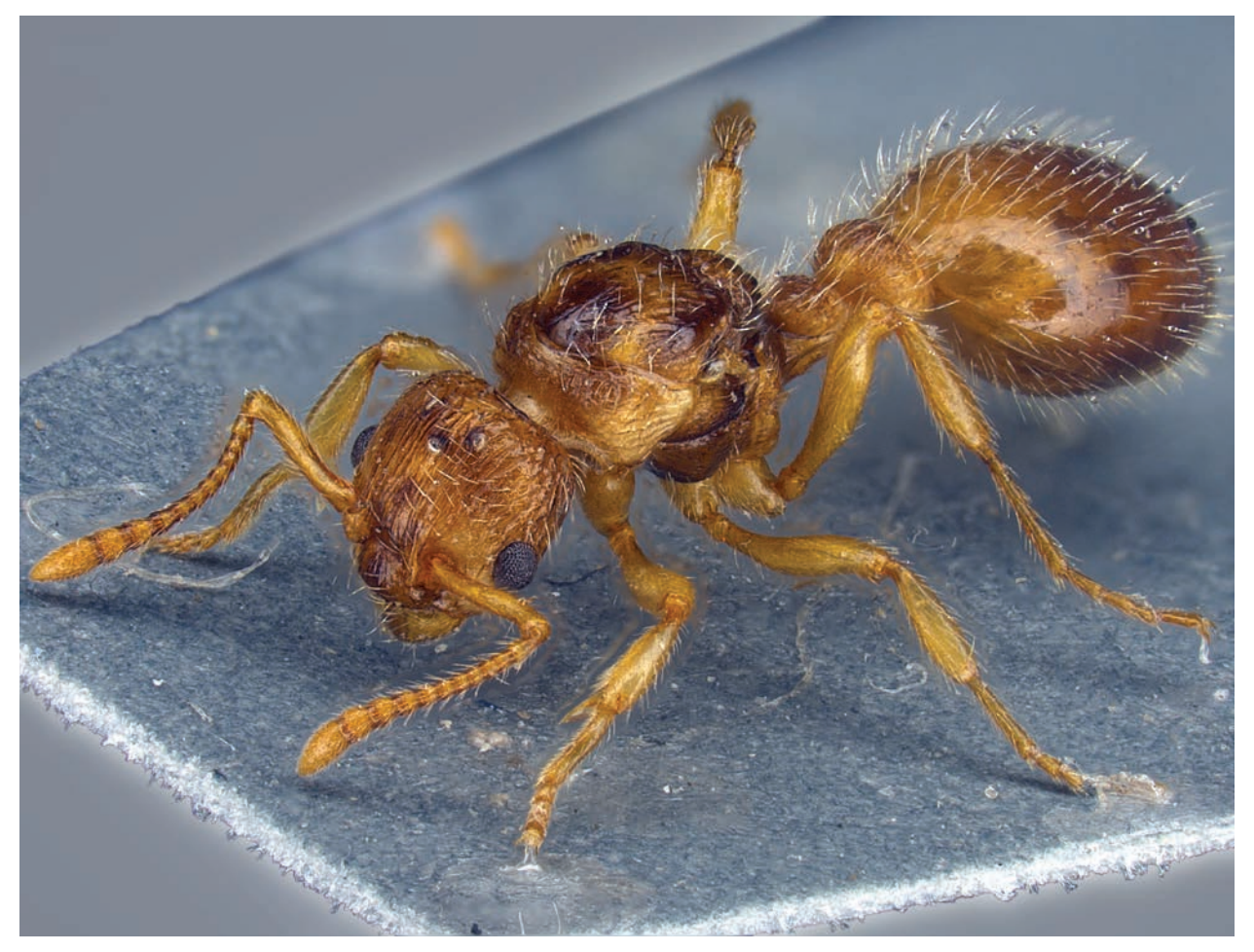
Figure 2. Gyne of Myrmica hirsuta Elmes, 1978 in standing position.