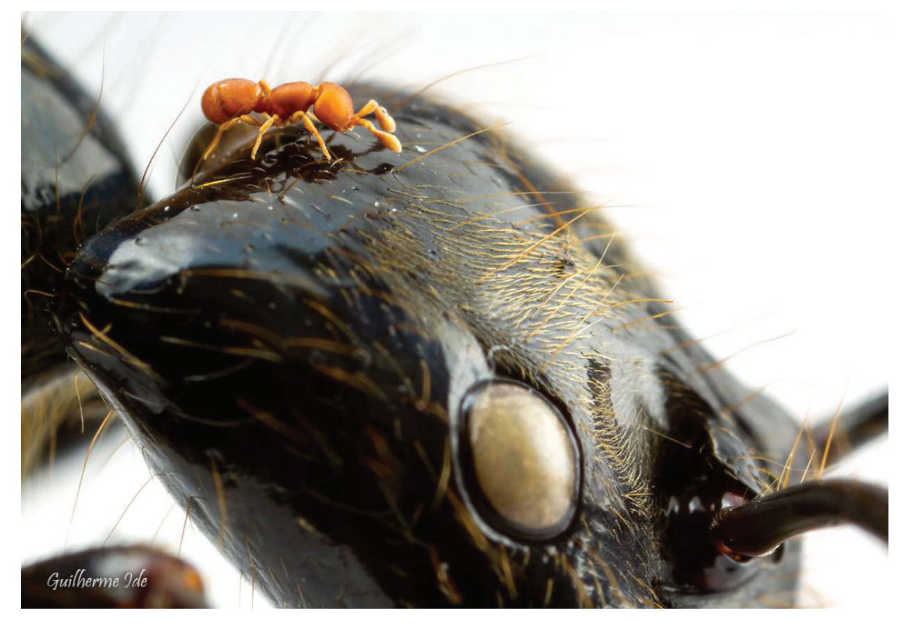
Figure 1. Largest species Dinoponera australis Borgmeier, 1937 with smallest species Discothyrea sexarticulata Borgmeier, 1954 on its head.

Correct labeling is essential in a scientific collection. Each sample tube or needle with mounted specimens has to carry at least two labels: The first label with information on sampling date, locality, and collector as well as a second label which includes the species name, the name of the determinator and, ideally, the year of determination. Without information on the exact locality and sampling date the prepared material can be considered scientifically worthless. The second label is in case of type material of taxonomically high importance. The labels should be made out of acid-free, fine card stock or thick paper. A non-neutral pH of the material would cause deterioration within 40-50 years, resulting in brittleness or, in the worst case, detachment from the pin. Especially in geographic regions with a high level of air humidity the latter process is accelerated dramatically. India ink that is preferably used for writing labels has been a timeproven standard for centuries. The use of laser printers is basically an excellent modern option but the long-term stability of the printed information has to be considered for which there is little experience. A printed label – using a font without serifs - seems to be most suitable to ensure