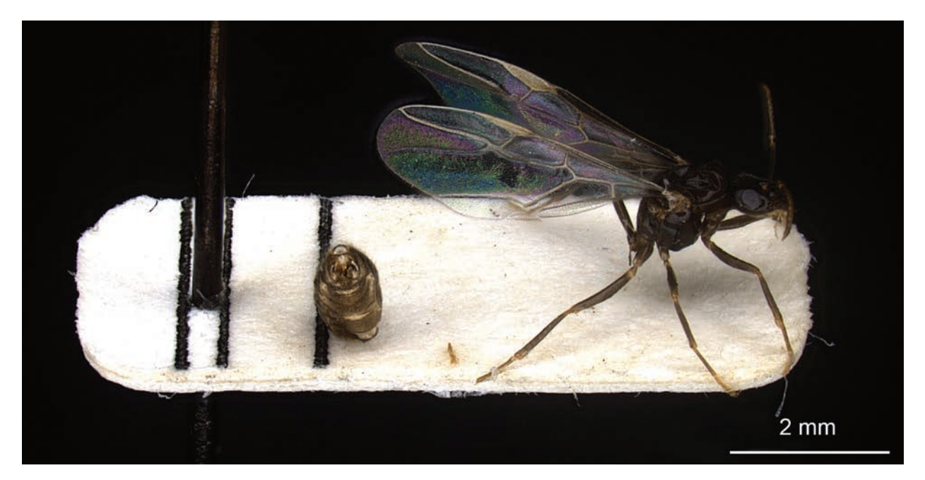
Figure 7. Prepared male of Lasius niger (Linnaeus, 1758) in standing position and cut gaster in upright position.