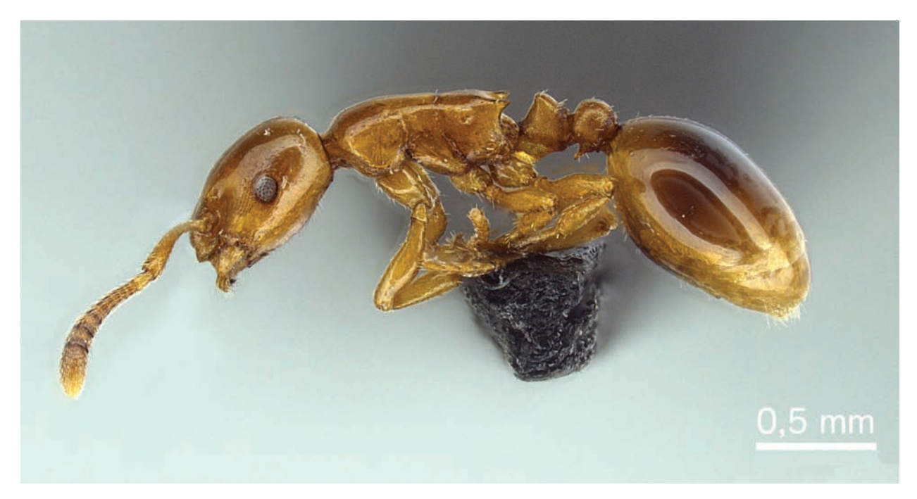
Figure 5. A combination of a basket-shape arrangement of legs with a preparation according to Wilson applied on Formicoxenus nitidulus (Nylander, 1846).