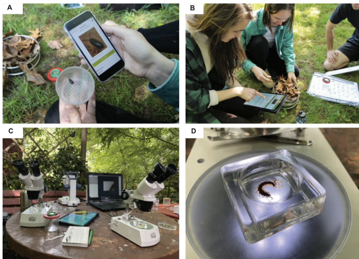
Figure 2. Pictures from training workshops in 2021. Top left (A): Participant compares its specimen with pictures in the mobile application. Top right (B): Participants are training the identification of soil animals in the field. Bottom left (C): Soil animal identification workshop with stereo microscopes. Bottom right (D): In ethanol preserved specimens of Chilopoda and Diplopoda.

types, biology and identification of soil animals. Thereby, we aimed to improve data quality by counteracting recording of falsely identified species (despite of expert validation) and to engage participants in the project. The program consisted of a general introduction which was followed by a collective exploration of the main functions of BODENTIERhoch4 (all participants were asked to download the application to their mobile phones or tablets in advance). Thereupon, the participants were equipped with a stereo microscope (10-40x), basic dissection tools and a set of specimens of Chilopoda and Diplopoda (identified at species-level and preserved in ethanol). During the identification process, participants could familiarize with the use of the identification keys and train their taxonomic skills. Subsequently the participants collected living soil animals and practised their skills with the mobile application. Whenever, during an excursion, specimen have been identified correctly, participants were encouraged to report their results via the recording functions of the application. All steps of animal identification were accompanied by an expert supervisor.