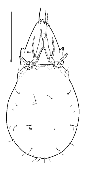
Fig. 1 Cultroribula berolina : dorsal aspect (legs not shown). – Abbreviations: lm , lp – notogastral setae; tut – tutorium. Scale bar: 100 µm.

Prodorsum: Rostrum with two very narrow incisions medial to rostral setae; incisions about 8 \mu m long, divide rostral tip into three triangular teeth; lateral anterior edge of rostrum with two further very small teeth, best visible in lateral view (Fig. 2). Lamellae moderately broad, converging and joining antero-medially; cavity present below lamellar blades in posterior part, near bothridia; cusps long, moderately broad, rounded tips bearing lamellar setae, space between cusps very narrow (Fig. 1). Tutoria long, posteriorly formed as rounded blade, anteriorly with long, acute cusps (Fig. 2). Sensilli claviform, with elongated, granulated heads and short stalks. Rostral and lamellar setae strong, setiform with distinct setulae; interlamellar setae short and fine (about 15 – 20 \mu m length); small exobothridial setae located below bothridia and above large pedotecta I.